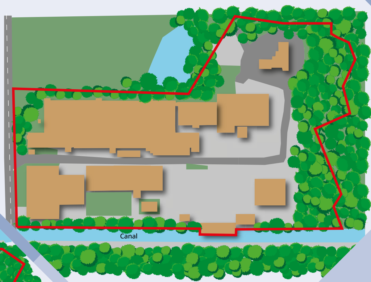
SITE A 147,499 SQ FT (13,703 SQ M) ON 11.40 ACRES (4.61 HA)