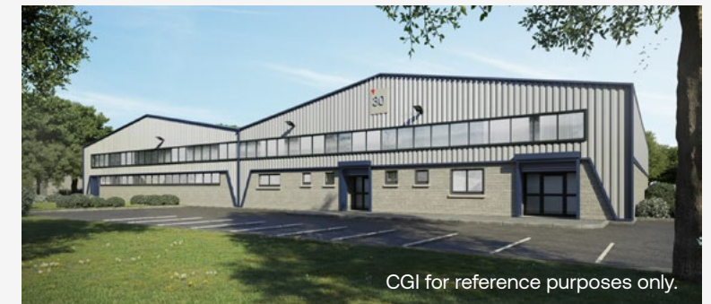
CGI for reference purposes only.