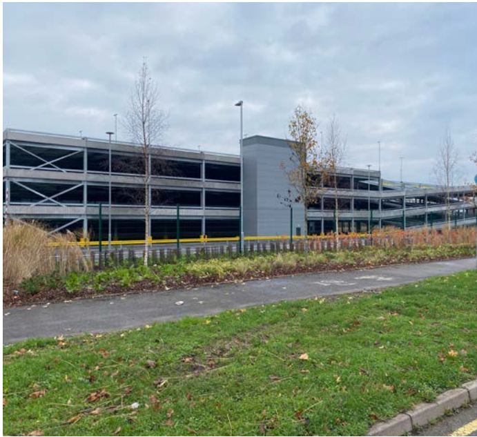
3 Storey Parking Deck