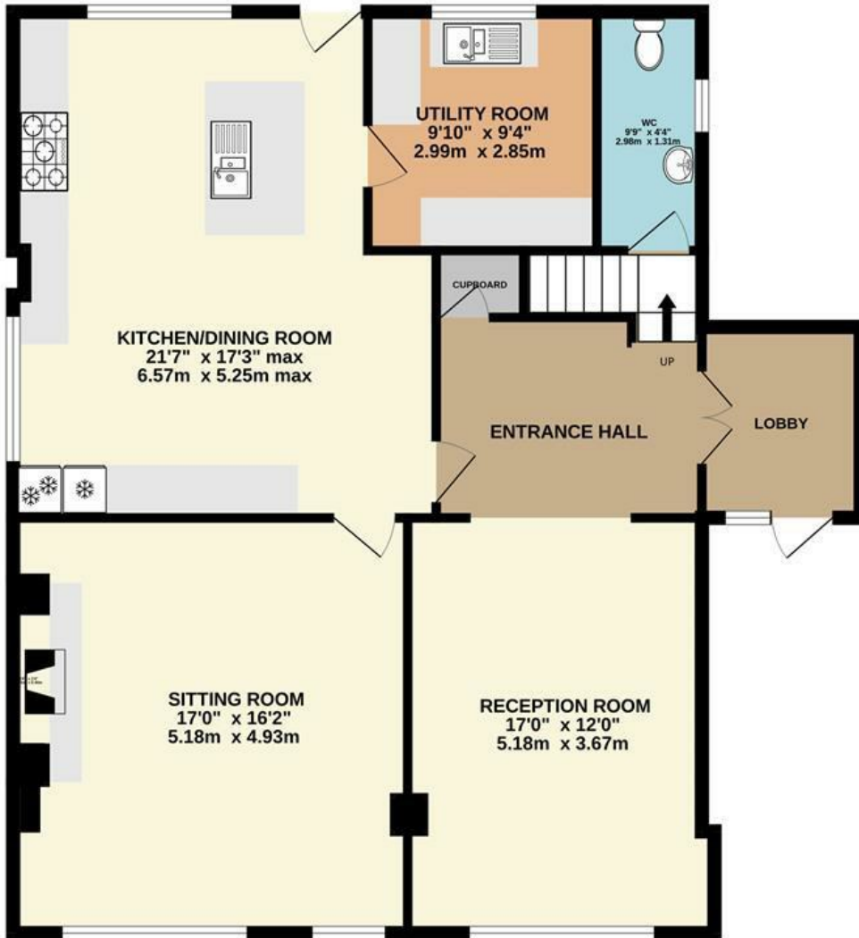
GROUND FLOOR 1108 sq.ft. (102.9 sq.m.) approx.