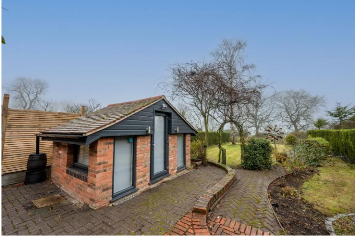
Studio/Home Office/Home Gym

https://plan.wychavon.gov.uk/Planning/Display/W/23/00102/HP