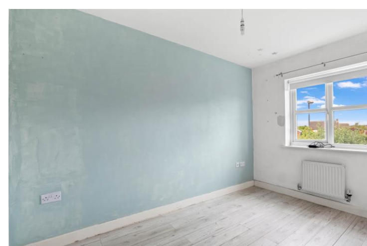
Bedroom Three 2.43m (8') x 2.24m (7'4")