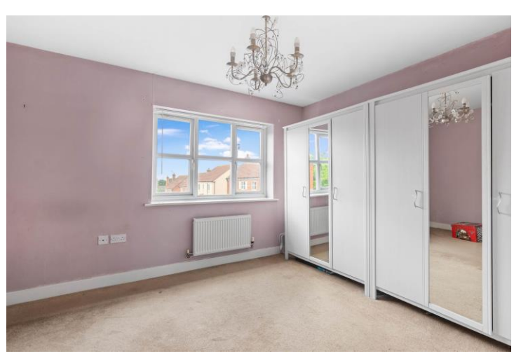
Bedroom Two 3.51m (11'6") x 1.96m (6'5")