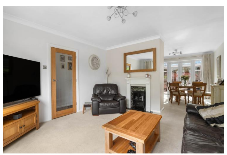
Living Room 4.00m (13'1") x 3.83m (12'7")