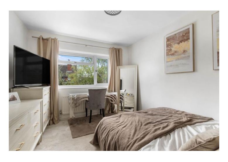
Bedroom Two 3.66m (12') x 3.10m (10'2")