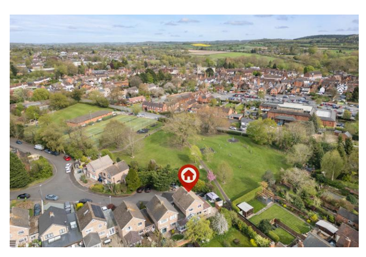
Floor Plans & Property Details Disclaimer

These plans are for identification purposes only in relation to where one room is situated to another. They are not to be relied upon in any way for dimensions, scaling or sq. ft/metres. We will not be held responsible for any loss incurred, due to reliance on these measurements from the floor plans or measurements from the property details. You are advised to confirm all measurements.