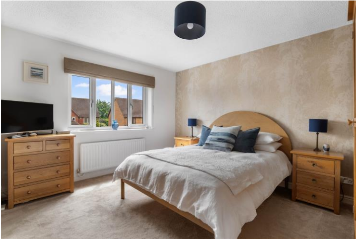
Bedroom One 13'2" x 12'6" (4.02 x 3.82)