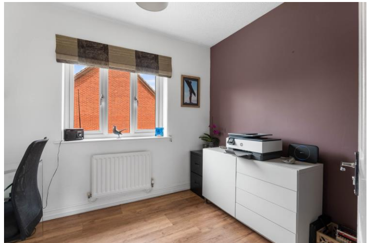
Bedroom Four 11'0" x 9'9" (3.35 x 2.98)