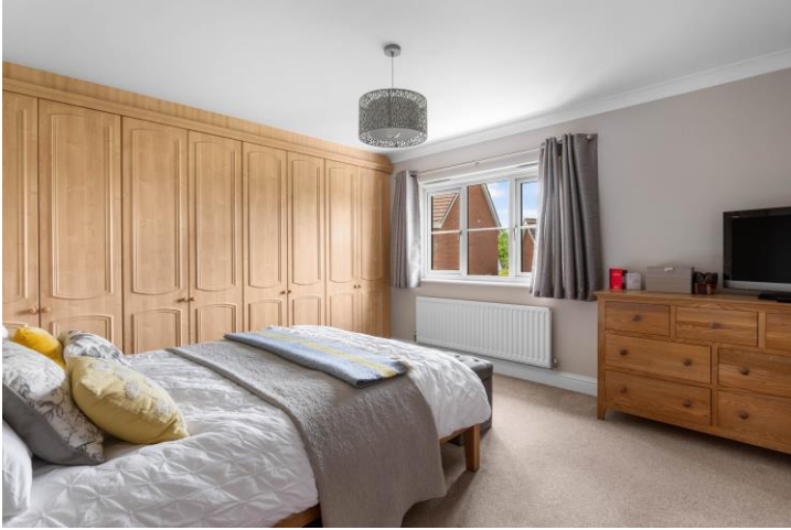
Bedroom One 13'1" x 12'3" (4.00 x 3.73)