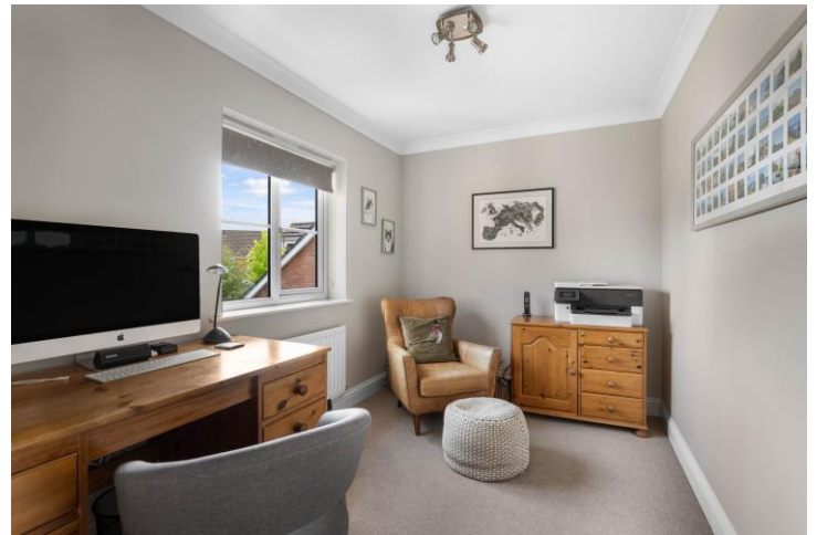
Bedroom Four 11'3" x 7'6" (3.43 x 2.29)