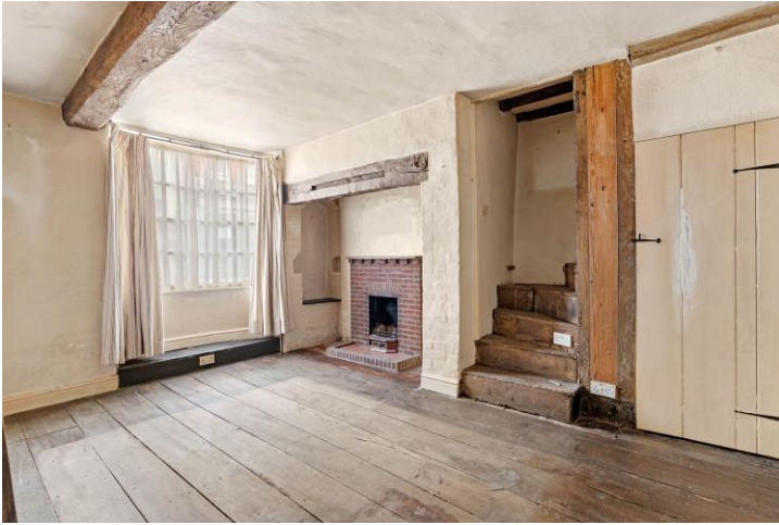
Lounge 14'2" x 8'5" (4.32 x 2.56)