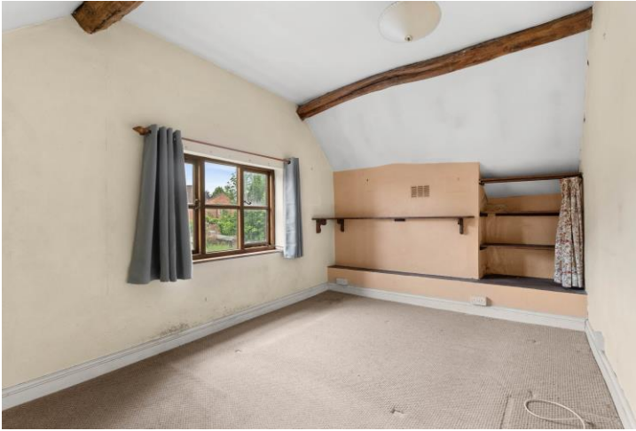
Bedroom Three 10'6" x 9'4" (3.21 x 2.85)