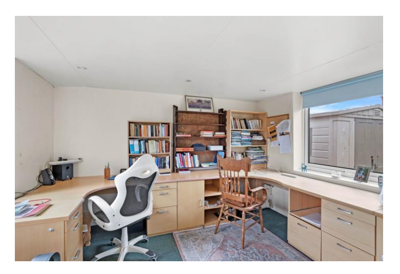
Detached Home Office 11'3" x 11'3" (3.43 x 3.43)

These floor plans are for identification purposes only in relation to where one room is situated to another. They are not to be relied upon in any way for dimensions, scaling or sq. ft/metres. We will not be held responsible for any loss incurred, due to reliance on these measurements from the floor plans or measurements from the property details. You are advised to confirm all measurements.