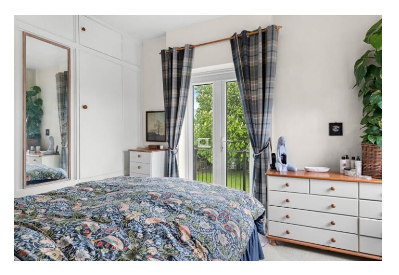
Bedroom Two 12'11" x 8'3" (3.93 x 2.52)