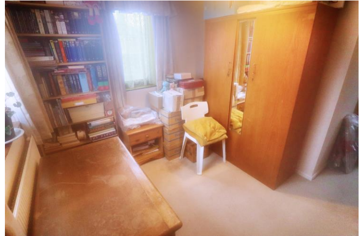
Bedroom Three Approximately 7' 6" (2.3m) x 7' 3" (2.23m)