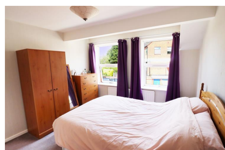
Bedroom Two 11' 9'' (3.58m) x 7' 6'' (2.29m) Bedroom One 11' 8" (3.56m) x 10' 9" (3.28m)