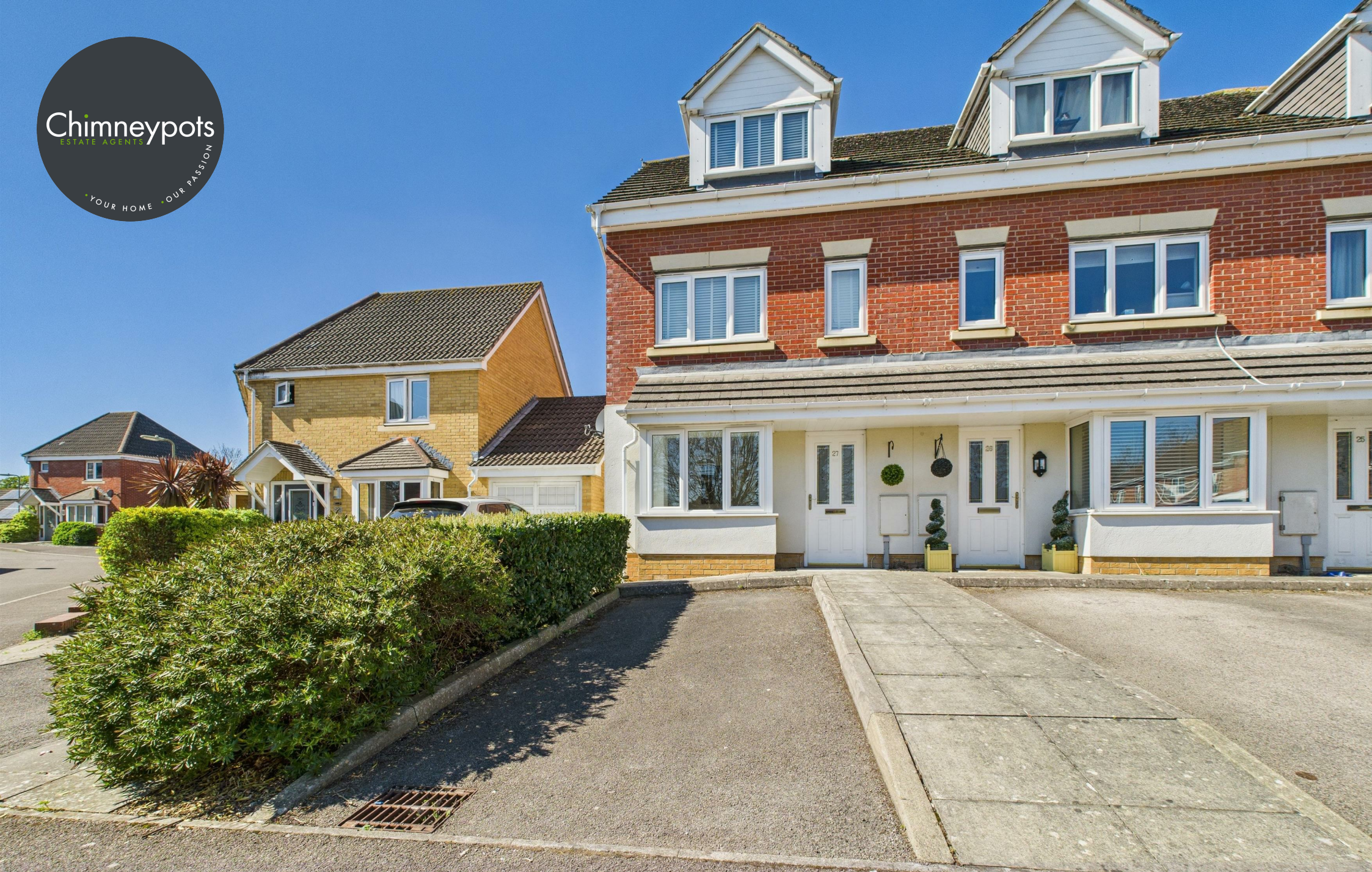
Titchfield Grange, Titchfield Park Asking Price £180,000