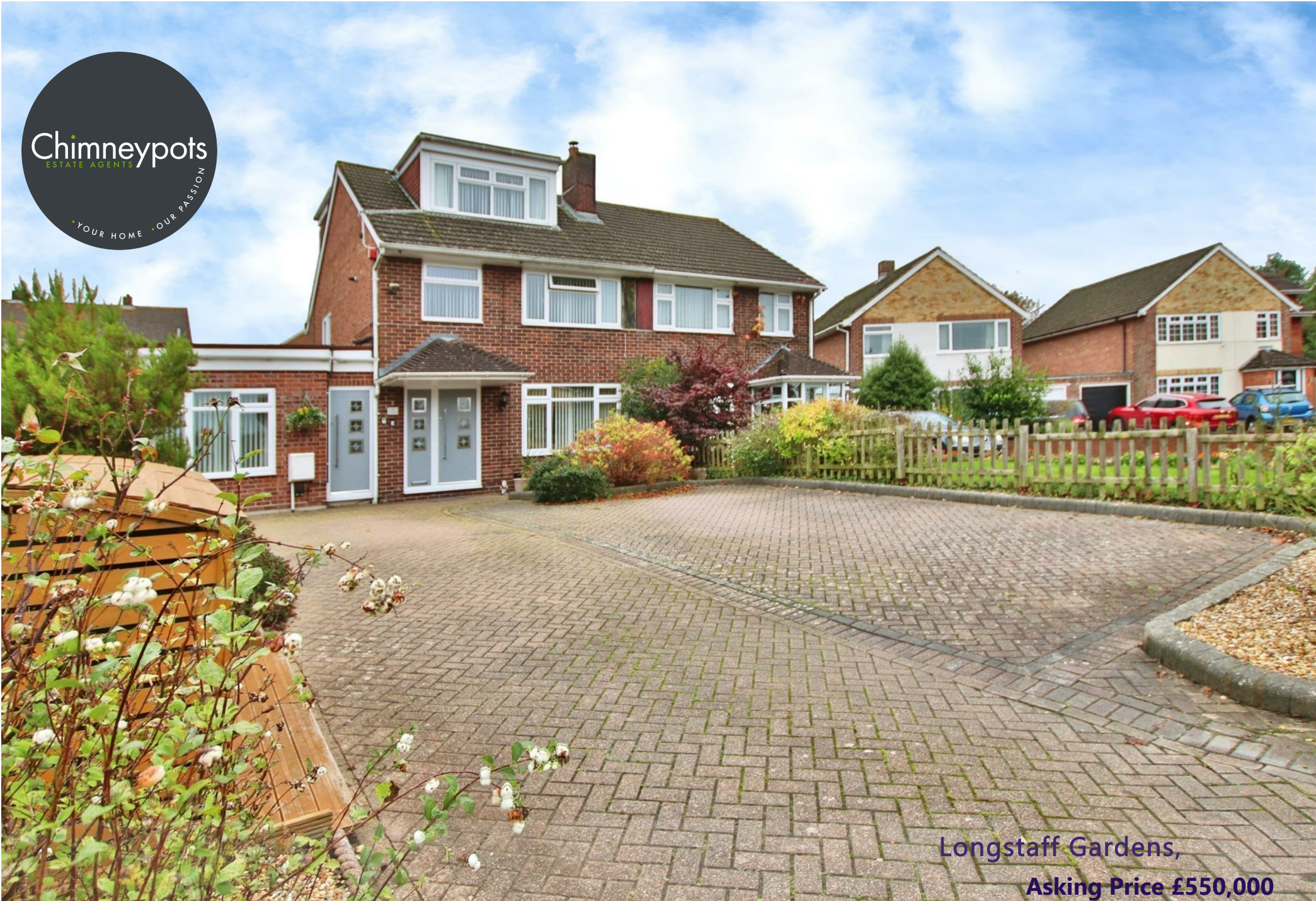
Longstaff Gardens, Asking Price £550,000