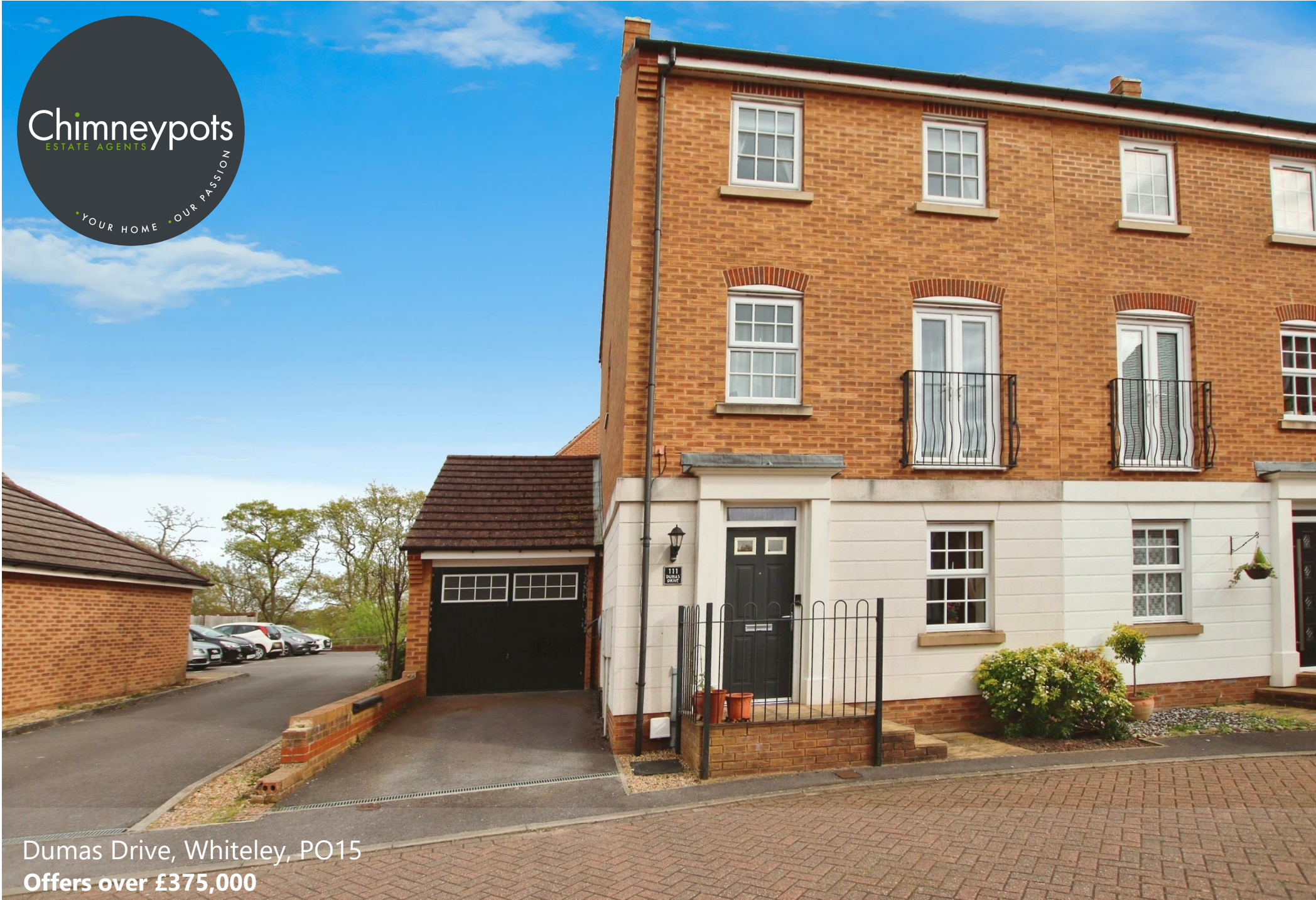
Dumas Drive, Whiteley, PO15 Offers over £375,000