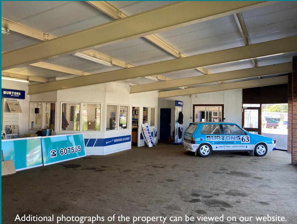
Additional photographs of the property can be viewed on our website.

Of interest to owner occupiers or developers (stp)