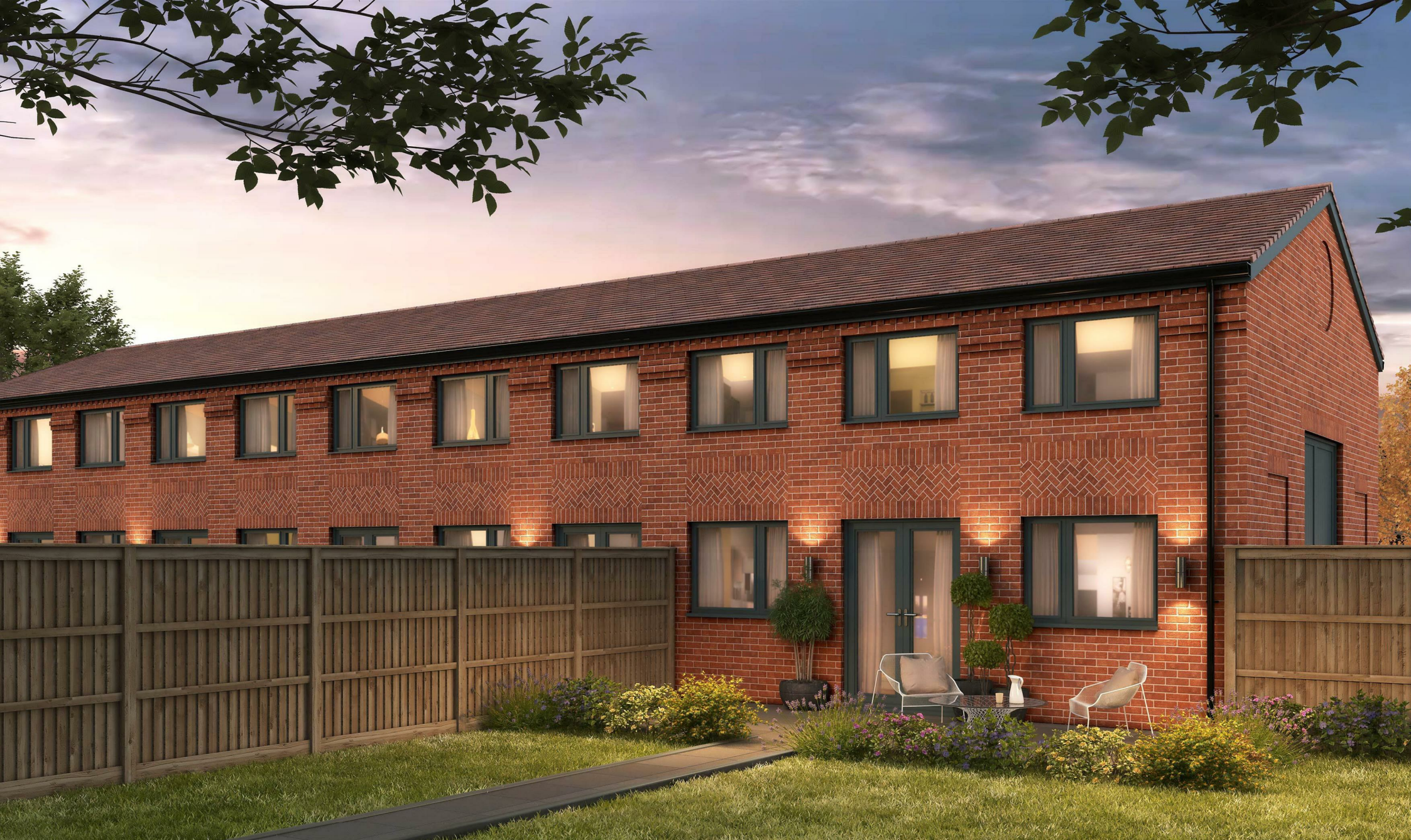
Mill Cottages , Marlfield Lane Redditch, B98 8PU