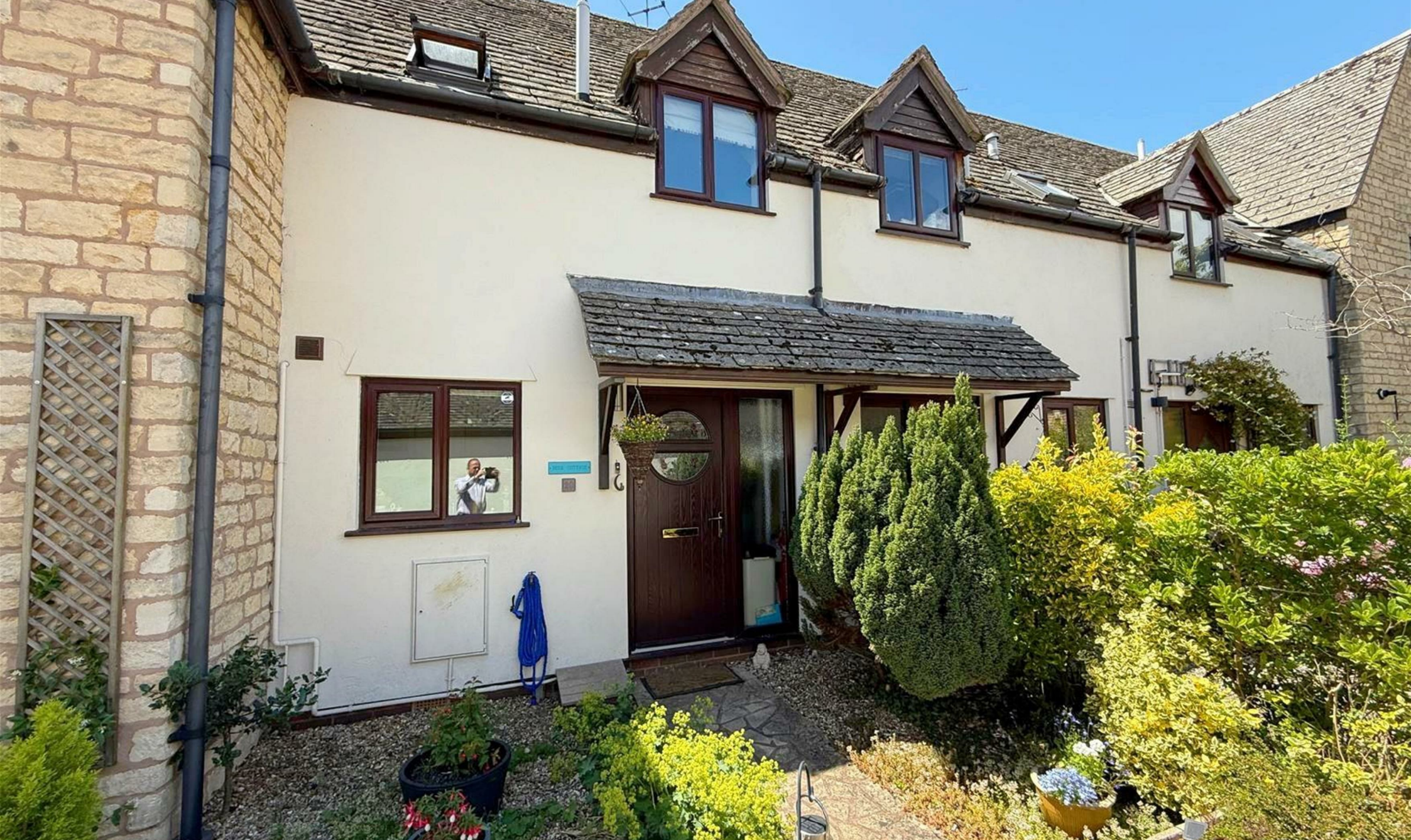
Greyrick Court , Mickleton , GL55 6TT