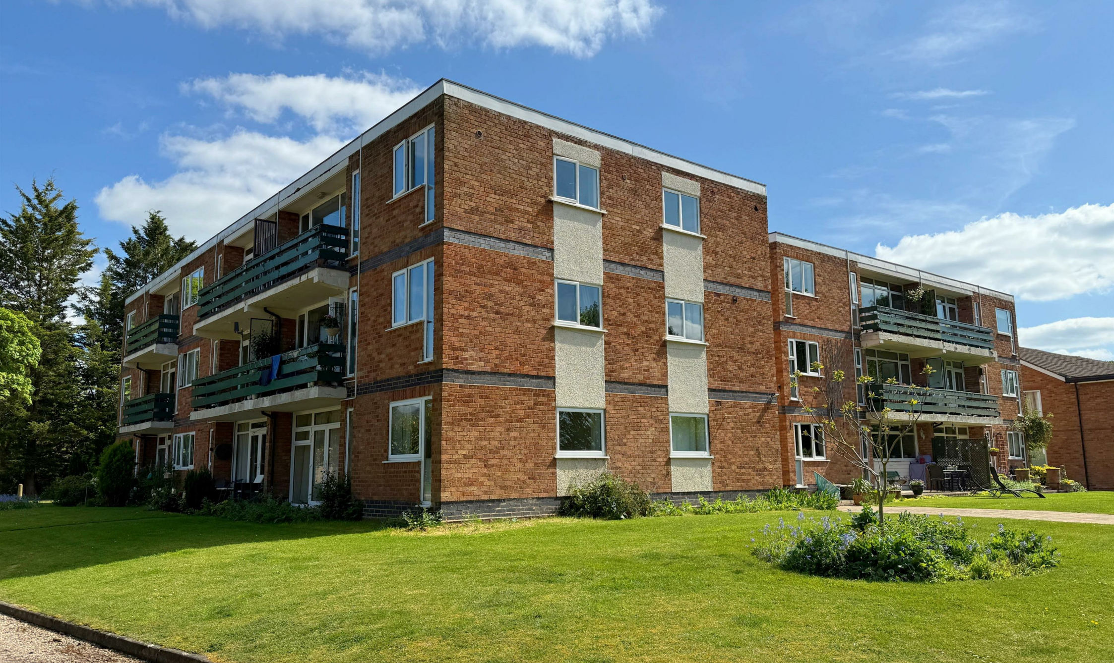
Dark Lane , Tiddington Stratford-upon-Avon, CV37 7AH