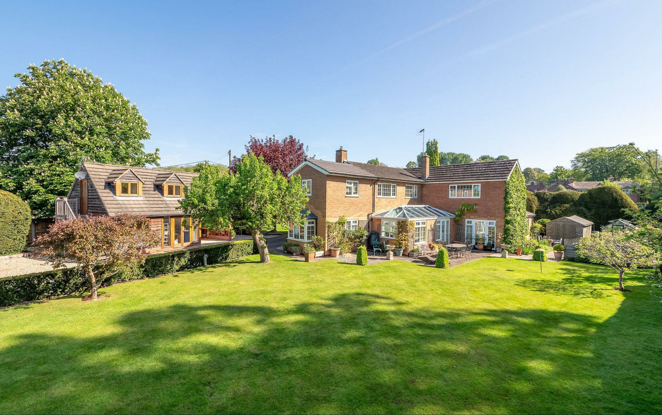
Allersmead House, Alderminster Stratford-upon-Avon, CV37 8NY