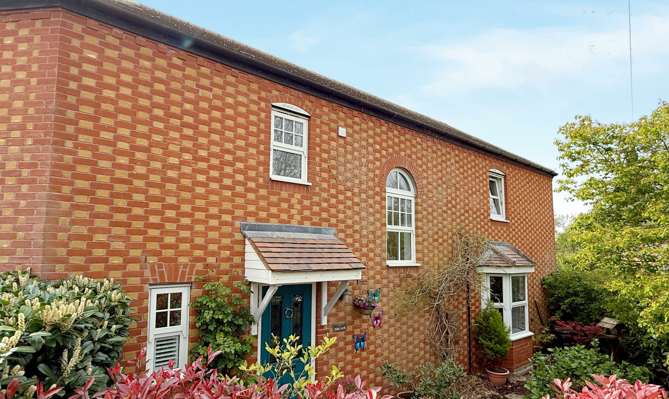
Park Lane , Lower Quinton Stratford-upon-Avon, CV37 8SP