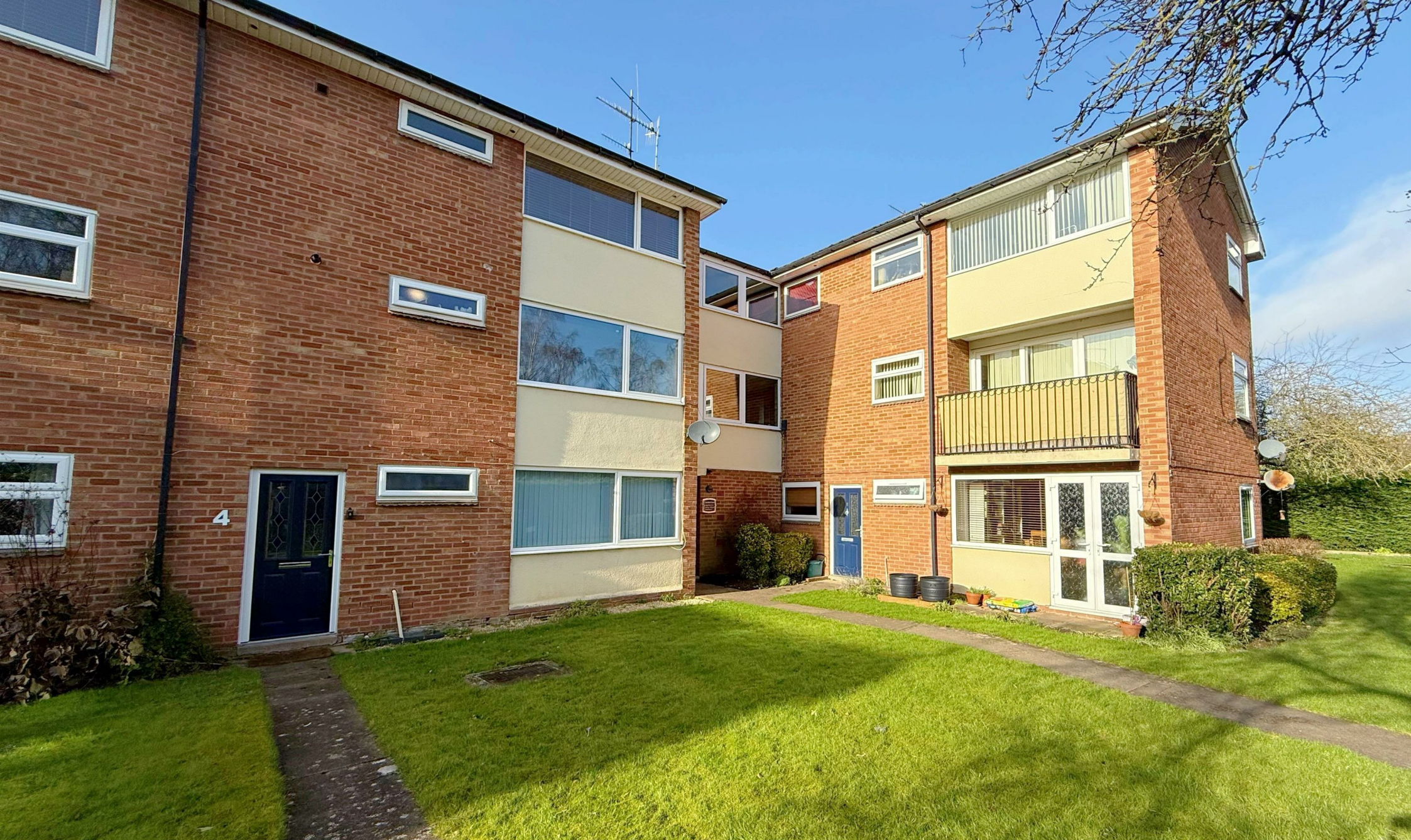
Sandfield Court , Stratford-upon-Avon, CV37 9AH