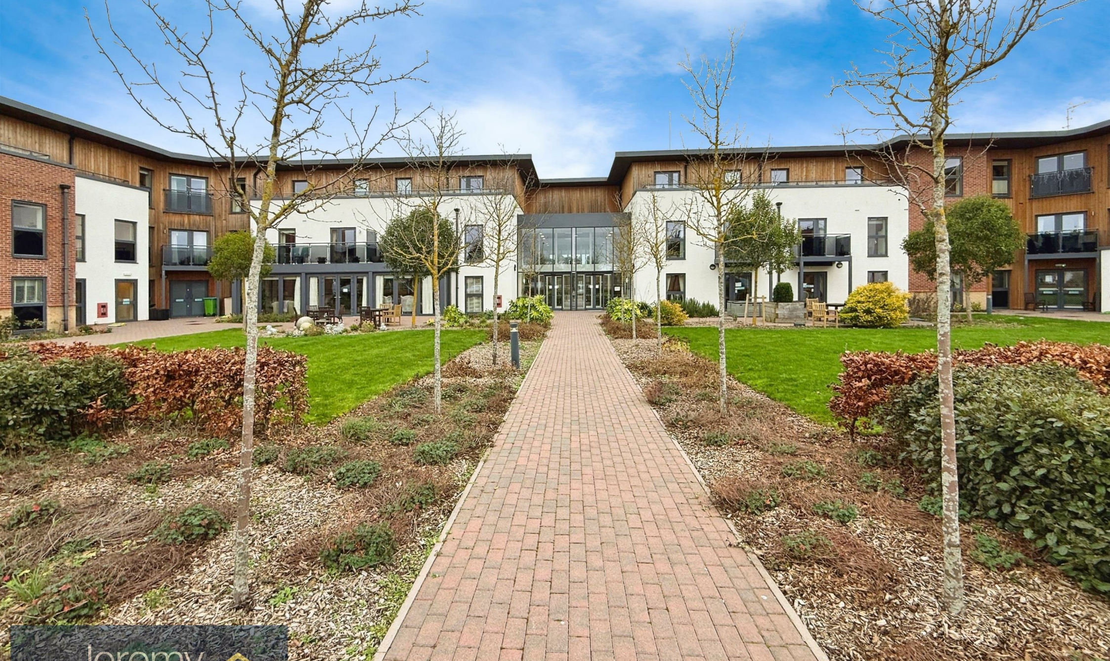
Harvard Place , Springfield Road Stratford-upon-Avon, CV37 8GA