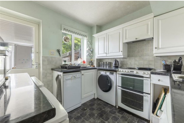
About Lorraine Gardens

No Onward Chain! Three bedroom property in a great location close to the City Centre.