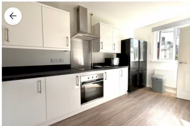
Available 25/26 Academic Year!

Six Bedroom student property available to rent for the 25/26 Academic year!