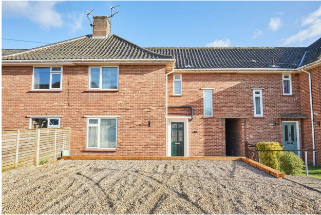
Nasmith Road, UEA

Recently Refurbished student property perfectly located for students at the UEA! 24/25 Academic year!