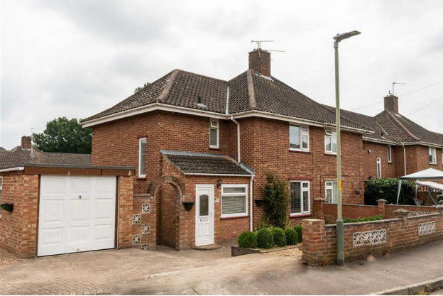
NASMITH ROAD, UEA

FIVE BEDROOMS - THREE SHOWERS - 24/25 ACADEMIC YEAR - LUXURY ACCOMMODATION.