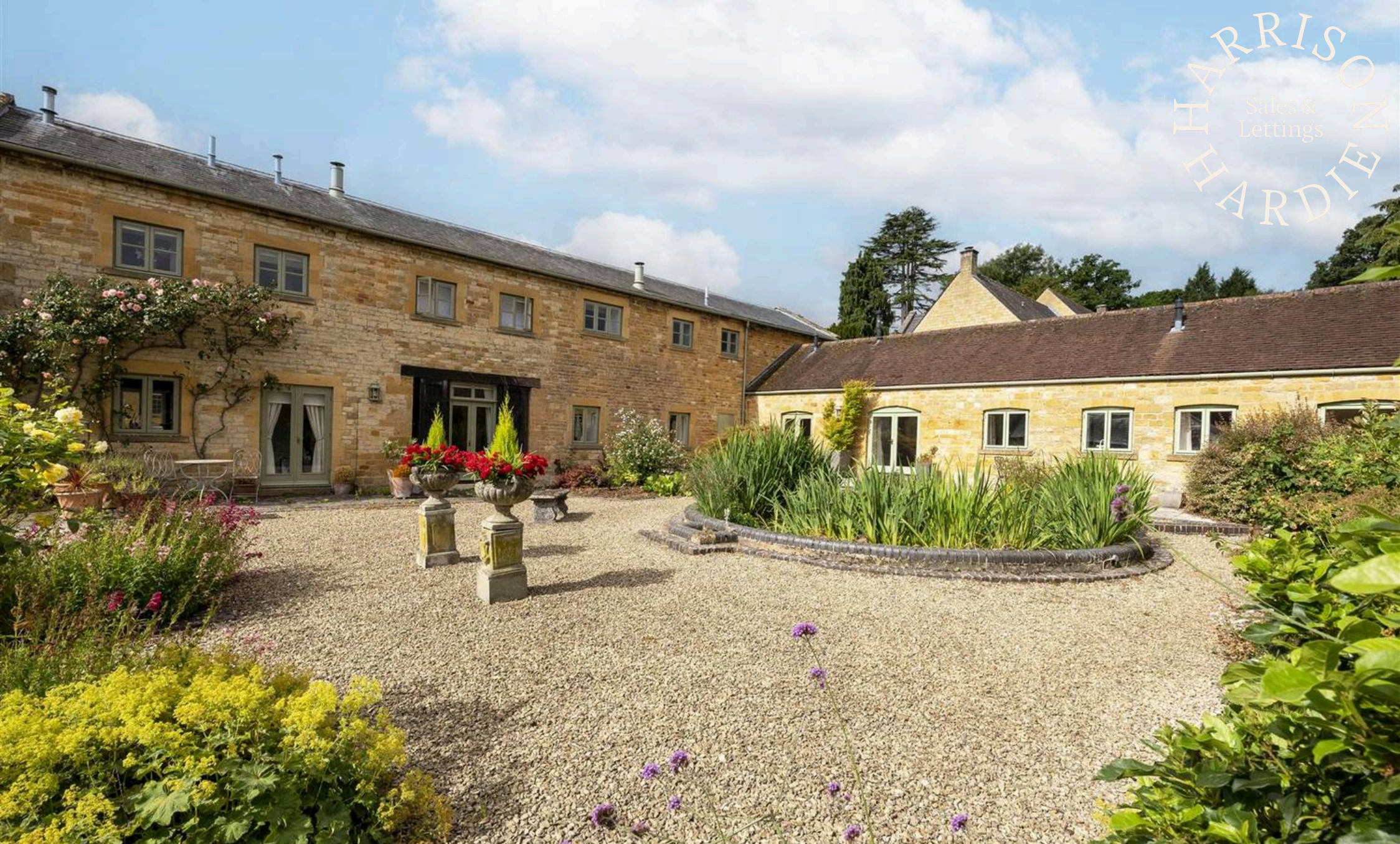
The Granary Northwick Park, Blockley