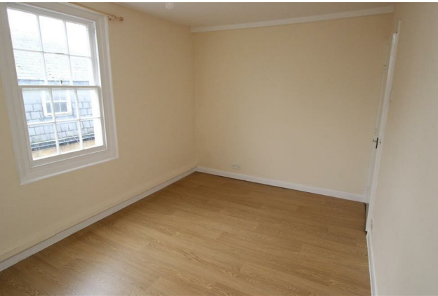
Bedroom 44'7" x 26'6" (13.6 x 8.10)