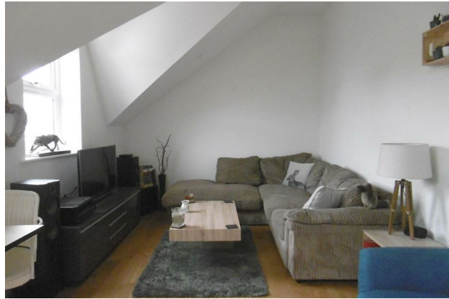
Longe/Kitchen 20'5 x 10'5 (6.22m x 3.18m)

Woodward&Bishopp are delighted to offer this contemporary luxury unfurnished apartment situated in Herne Bay town, steps away from the Seafront. Open-plan lounge/contemporary kitchen with some built-in appliances, luxury bathroom with fitted units and double bedroom. Oak flooring throughout with under-floor heating, double glazed windows. Access to communal garden space which offers bike and bin storage areas. Suit professional person/couple. Minimum Income £24,500. Available early August.