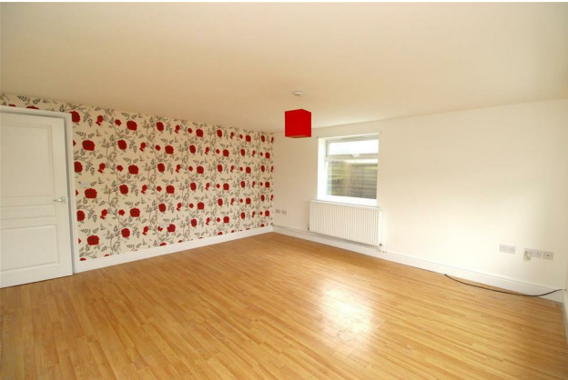
Lounge 16'0 x 14'03 (4.88m x 4.34m)

Woodward&Bishopp are delighted to offer this well presented, recently decorated, spacious ground floor property situated near to local shops, railway station & popular Tankerton beach. Accommodation comprises: Lounge, Kitchen, Two Double Bedrooms, En-Suite Shower to main, bathroom. Outside you will find a courtyard garden & has the added benefit of one allocated parking space. Suit professional couple/small family. Min annual income £31,500. Available now.