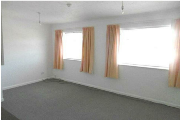
Reception Room 18'9 x 11'5 (5.72m x 3.48m)