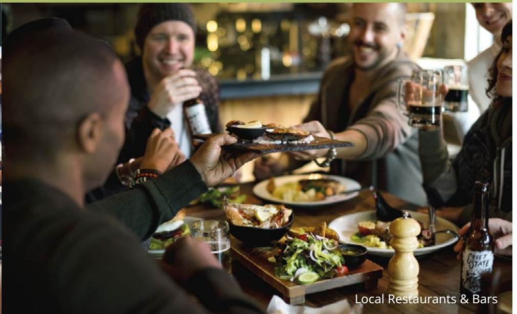
Local Restaurants & Bars