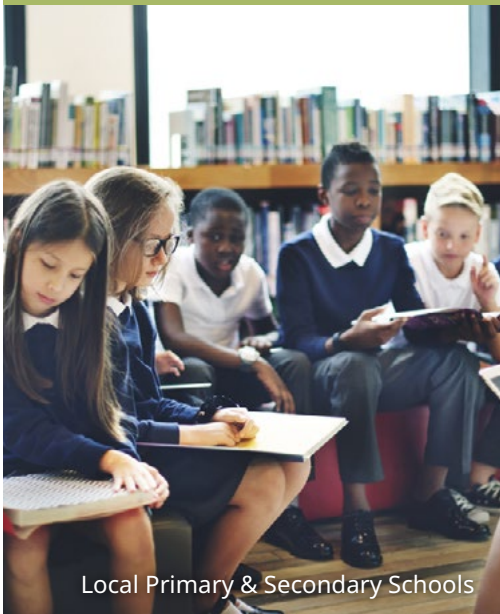
Local Primary & Secondary Schools