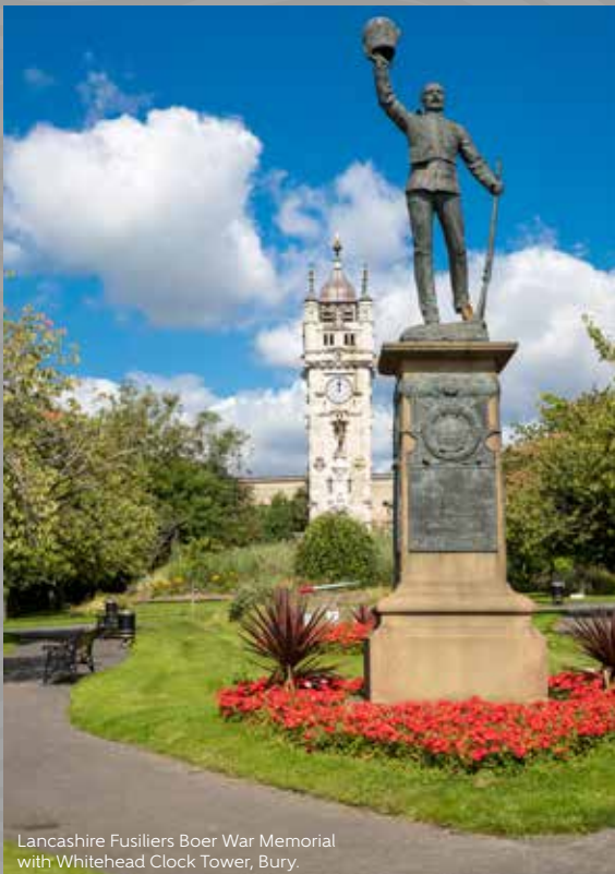
Lancashire Fusiliers Boer War Memorial with Whitehead Clock Tower, Bury.

Bridleway Grange's location just 10 miles north-west of Manchester city centre means there's plenty of options for travel throughout the area. Little more than five minutes away by car is Bury tram station, which offers regular services into the heart of Manchester and is only a 30-minute trip. Alternatively, with junction 17 of the M60 only five miles away, it's quick and easy for residents of the development to travel throughout the area by car. Bury town centre is just over a mile away, while Bolton is a little over 20 minutes' drive and Manchester is just over a 30-minute journey.