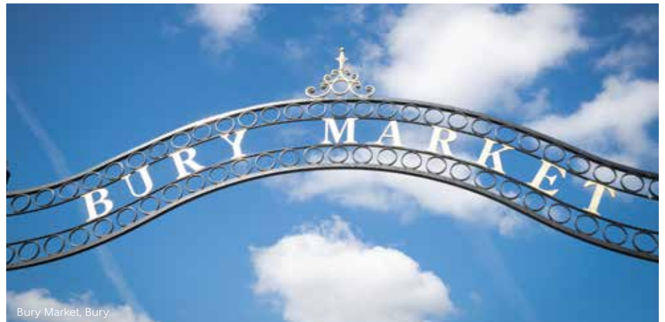
Bury Market, Bury.