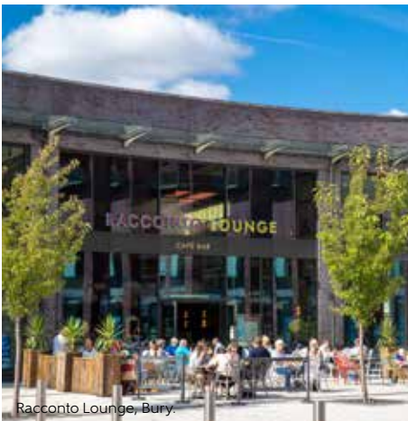
Racconto Lounge, Bury.

Built across a variety of styles to the Bellway first-class Artisan specification, these homes present a range of design features suitable for modern lifestyles including open plan living spaces, contemporary fitted kitchens and en-suite bathrooms in addition to either garages or allocated parking to each property.