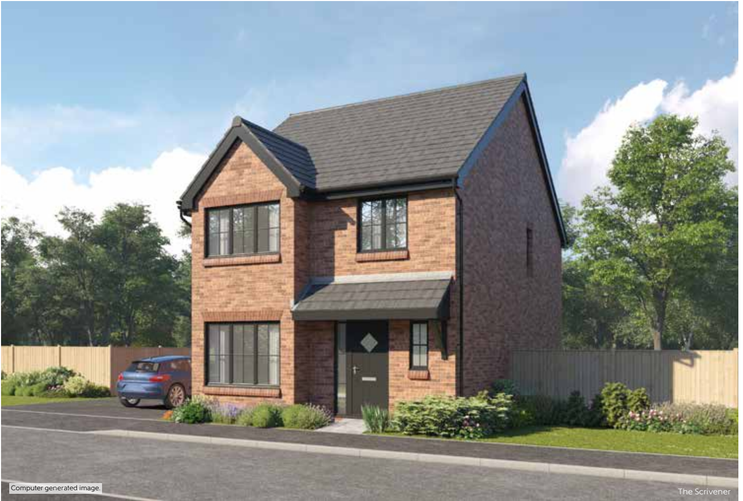
Computer generated image.