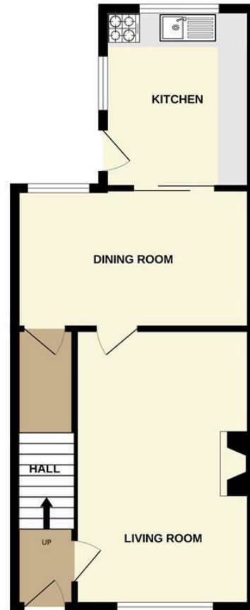
GROUND FLOOR 471 sq.ft. (43.7 sq.m.) approx.