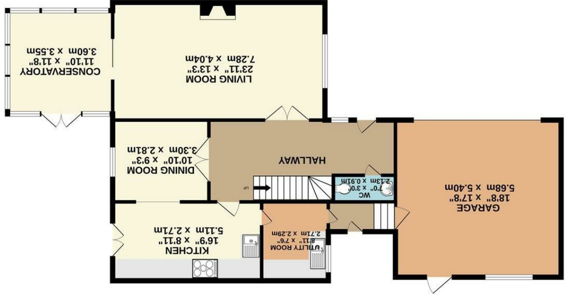
GROUND FLOOR 1312 sq.ft. (121.9 sq.m.) approx.