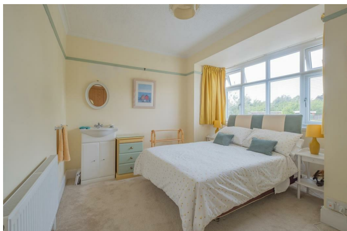
Double glazed bay window to rear. Radiator. Wash hand basin.