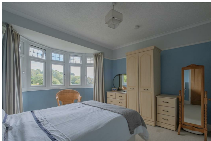
Double glazed bay window to front with sea views. Radiator.