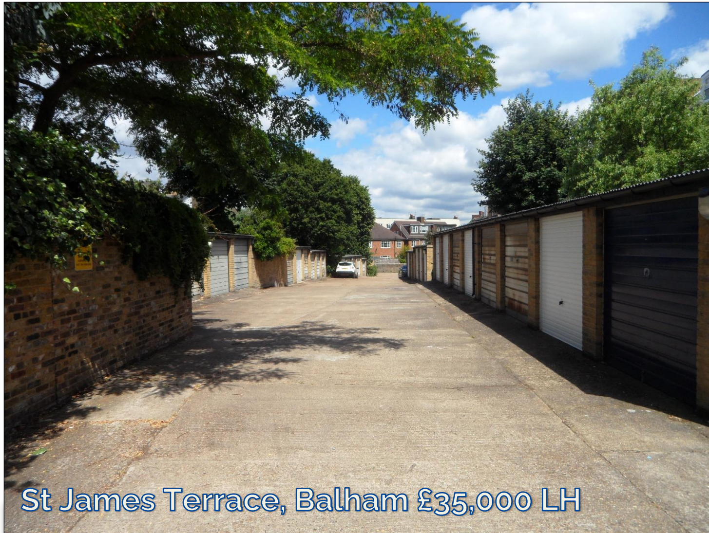
St James Terrace, Balham £35,000 LH

240 Balham High Road London SW17 7AW Tel: 020 8772 1004 www.porters.property info@porters.property DX: 41604 Balham