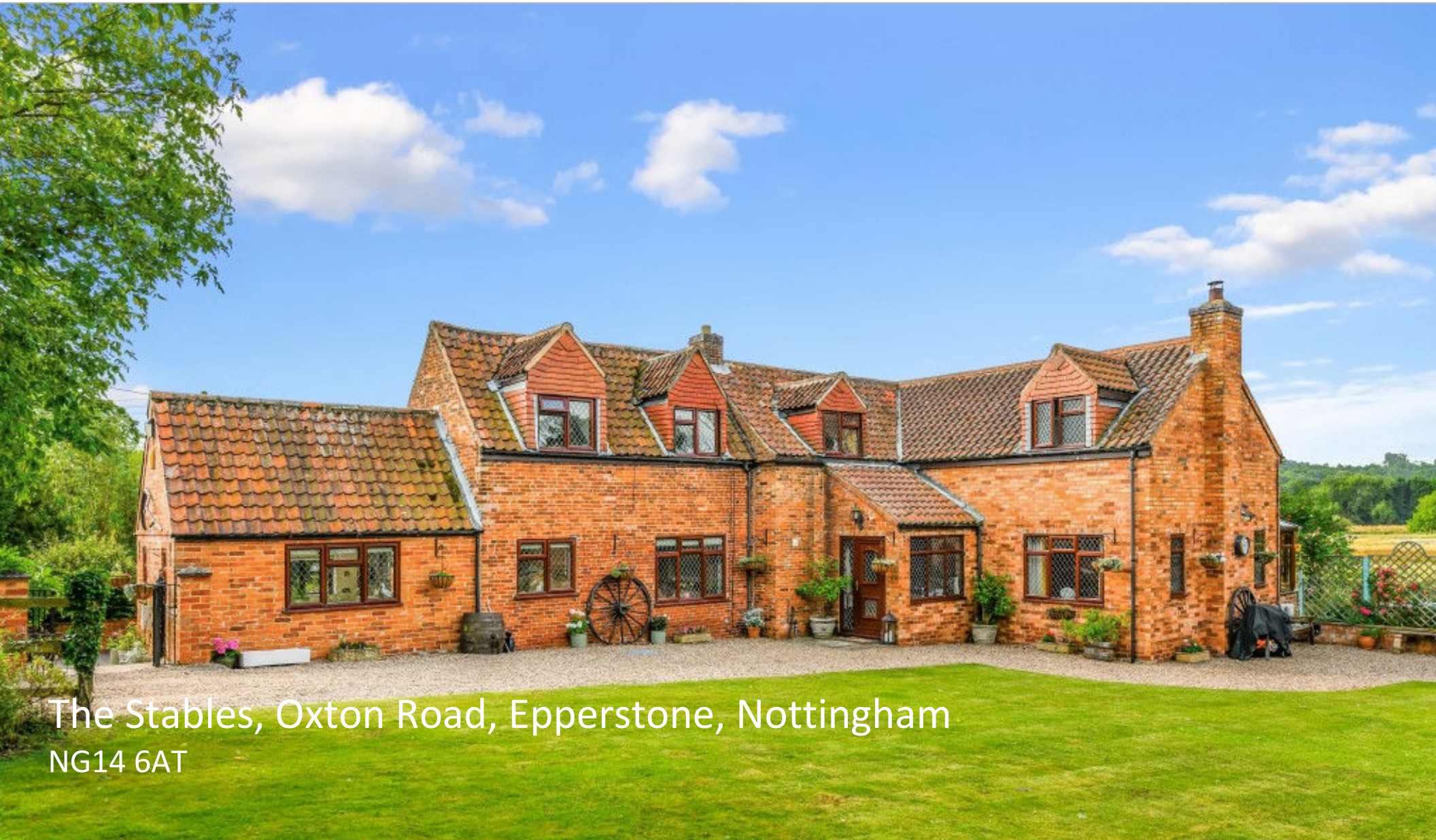
The Stables, Oxton Road, Epperstone, Nottingham NG14 6AT

Consultative Estate Agents with Integrity