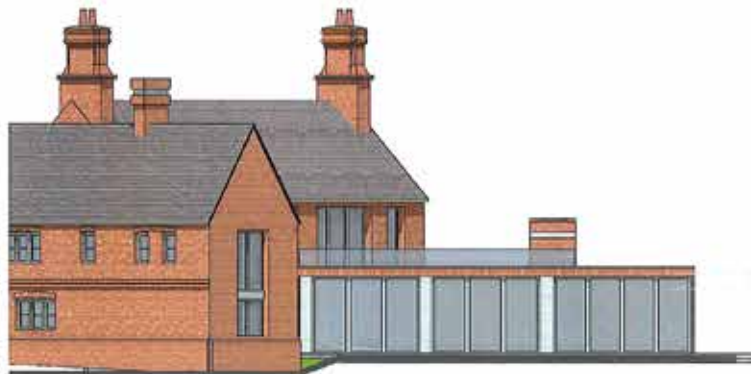
PROPOSED SIDE / SOUTH-WEST ELEVATION