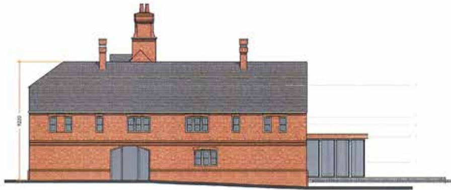
PROPOSED SIDE / WEST ELEVATION