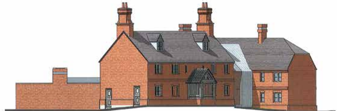
PROPOSED SIDE / NORTH-EAST ELEVATION