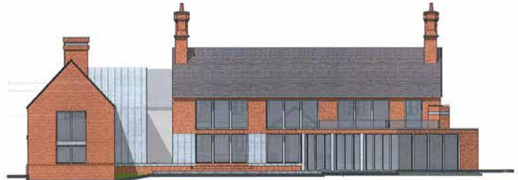
PROPOSED REAR / SOUTH ELEVATION