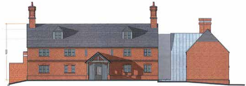
PROPOSED FRONT / NORTH ELEVATION