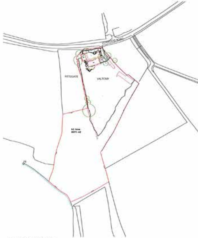
LOCATION PLAN 1:1250 DO NOT SCALE OFF THIS DRAWING EXCEPT FOR PLANNING PURPOSES Ordnance Survey, 30 Crown Copyright 2018. All rights reserved. Licence number: 100023832