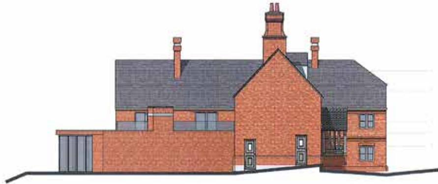
PROPOSED SIDE / EAST ELEVATION