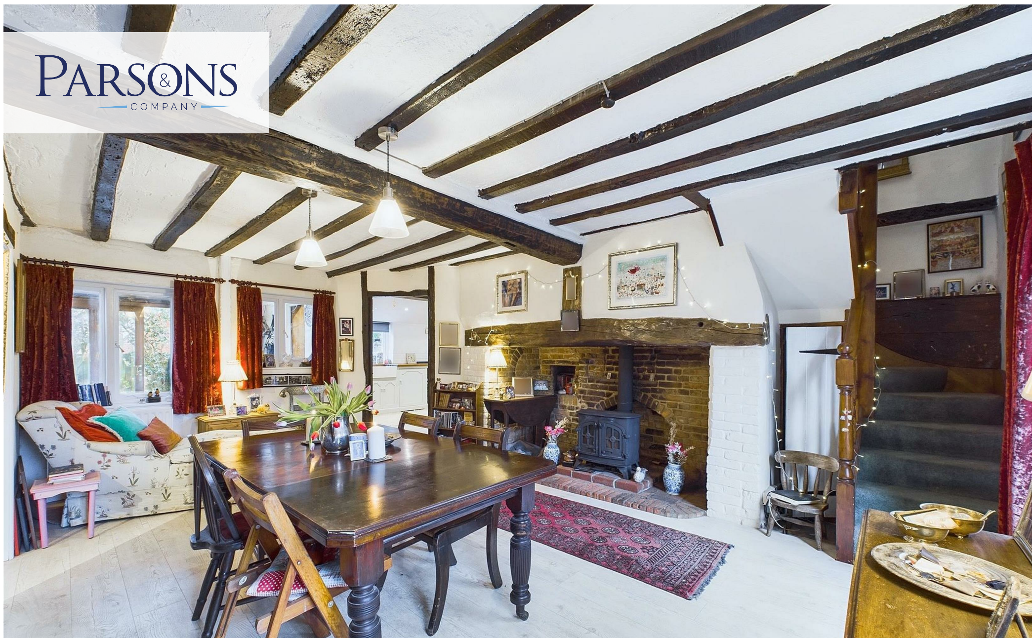
Hill House 8 Station Road, Reepham, Norfolk, NR10 4LF £550,000