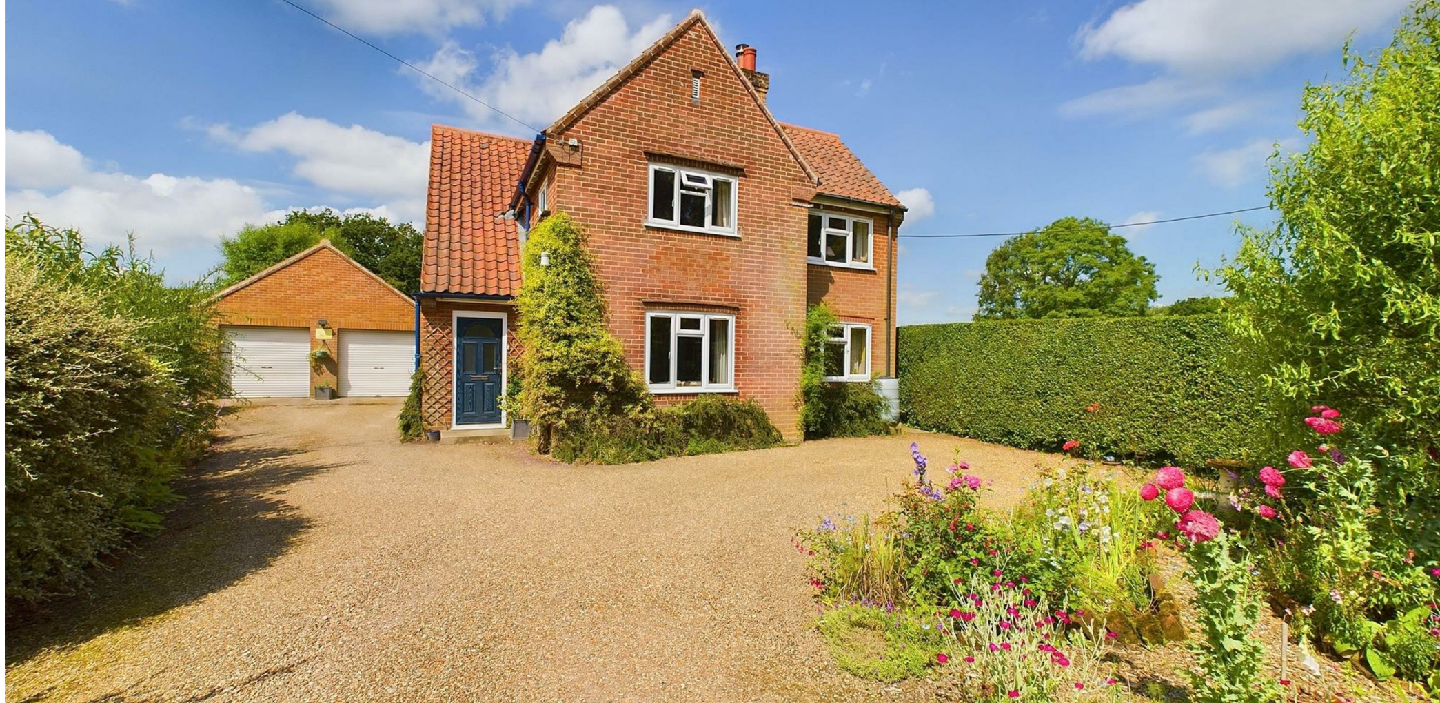
The Old Police House Holt Road, Cawston, Norfolk, NR10 4HS £445,000