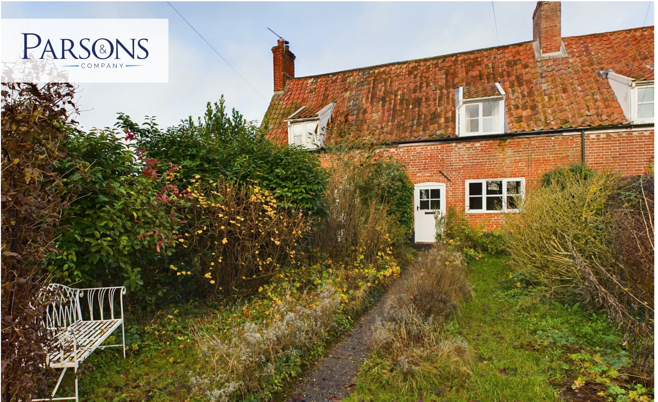
Plum Tree Cottage 3 Sunnyrow, Kerdiston, Norwich, Norfolk, NR10 4RU £225,000