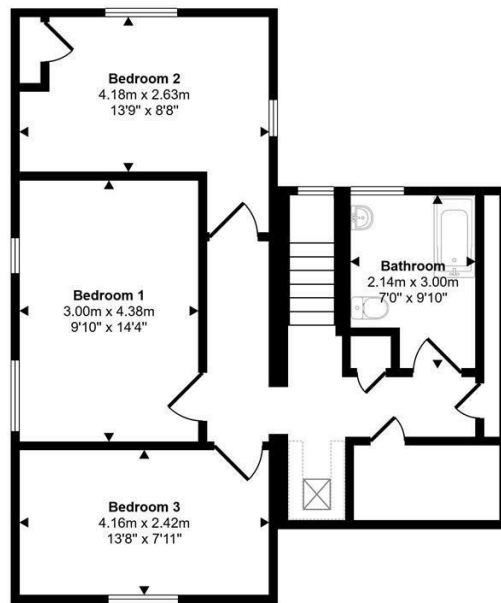
First Floor Approx 61 sq m / 661 sq ft