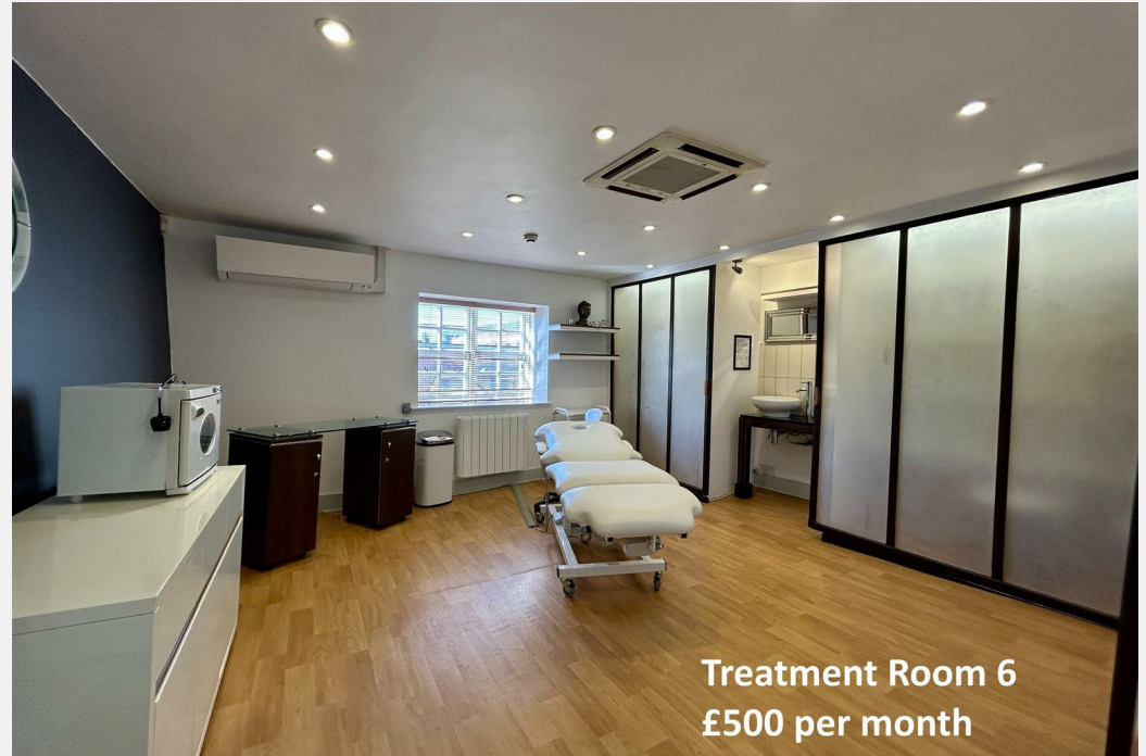
Treatment Room 6 £500 per month

Consumer protection from unfair trading regulations 2008 (CPR) We endeavour to ensure that the details contained in our marketing are correct through making detailed enquiries of the owner(s), however they are not guaranteed. Jackson Property Group have not tested any appliance, equipment, fixture, fitting or service. Any intending purchasers must satisfy themselves by inspection or otherwise as to the correctness of each statement contained within these particulars. Any research and literature advertised under the material information act will have been done at the time of initial marketing by Jackson Property Jackson Property may be entitled to commission from other services offered to the client or a buyer including but not limited to: Conveyancing, Mortgage, Financial advice and surveys.