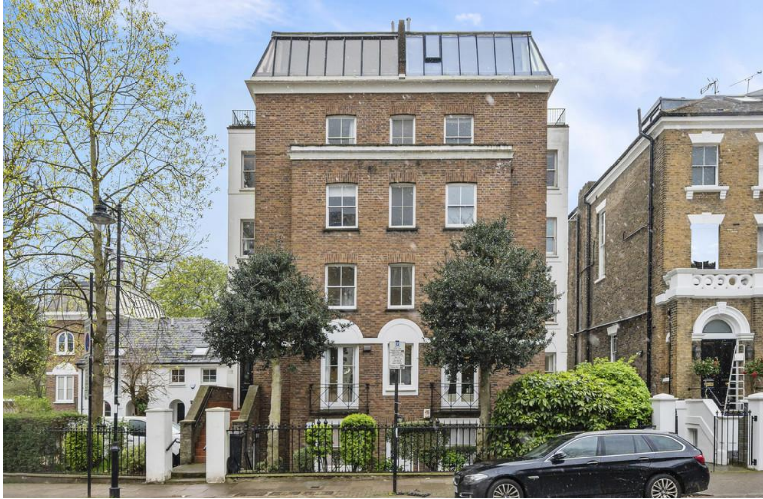
Highbury Hill N5 1BA