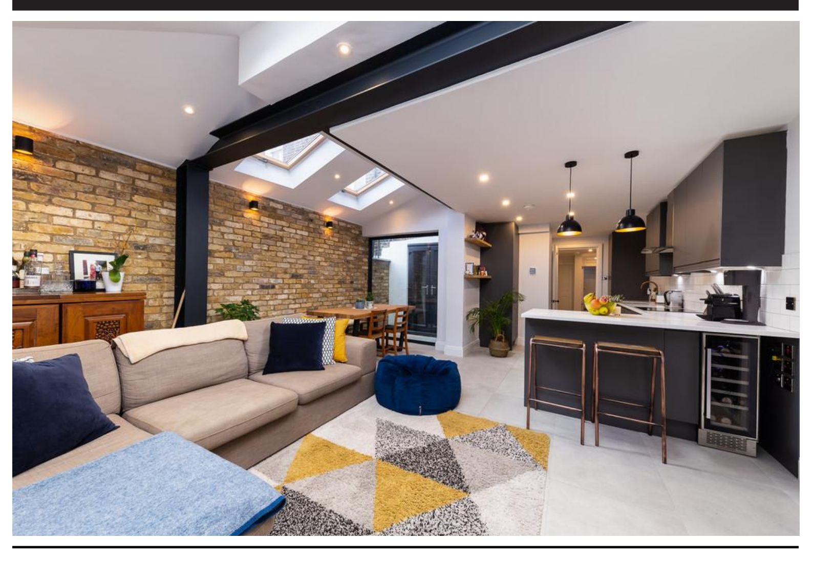
Riversdale Road, N5 2JP