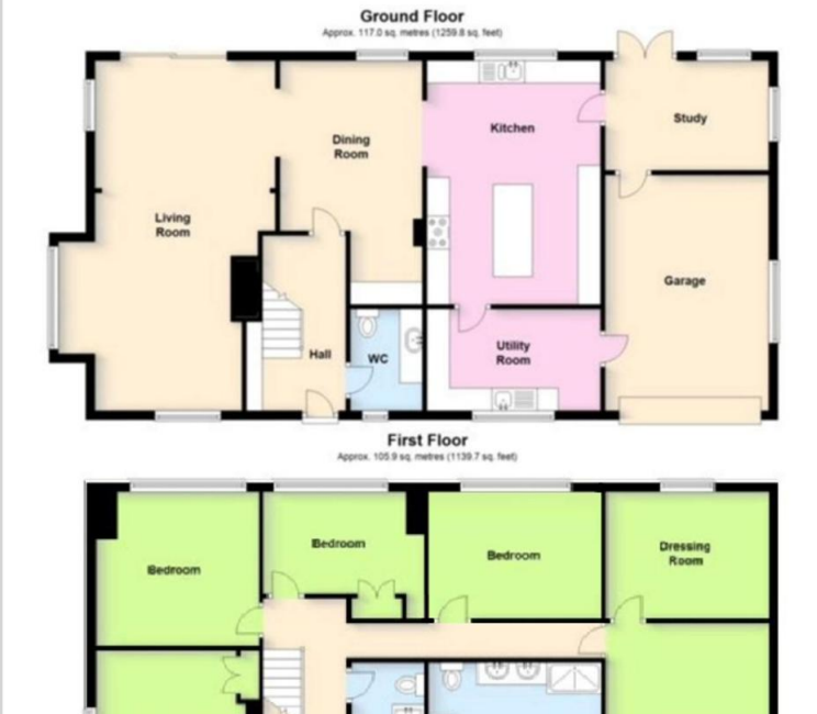
Total area: approx. 222.9 sq. metres (2399.5 sq. feet)