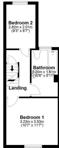
First Floor Approx. 28.9 sq. metres (311.0 sq. feet)