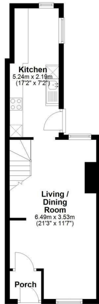
Ground Floor Approx. 34.1 sq. metres (367.1 sq. feet)